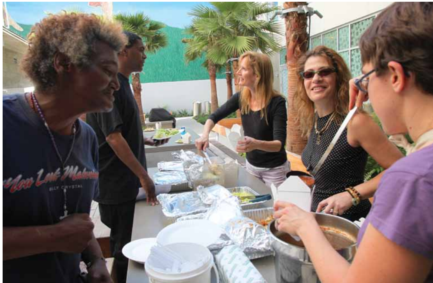
Volunteers from Zen Center serving lunch at the transitional housing Richardson Apartments. The food is prepared in the City Center kitchen. "We don't plan the meals," says one volunteer. "We just show up and see what's available."

The chapel is a former library in a private home, with massive wooden doors, chandeliers with patterned glass bulbs, and lots of windows. The practice in this inspiring yet nontraditional setting is less formal than practice at City Center, Green Gulch, or Tassajara, but the evening's layout contains all the standard elements: We sit zazen, chant and bow, drink tea, and hear a dharma talk followed by time for discussion. On the April evening