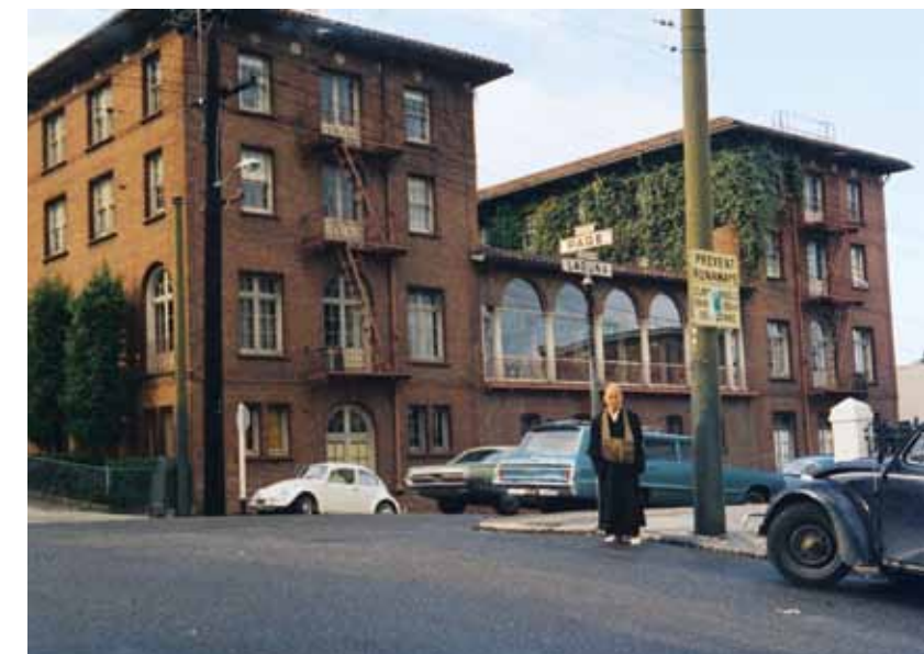
Shunryu Suzuki Roshi, founder of San Francisco Zen Center, in front of City Center, c. 1969.