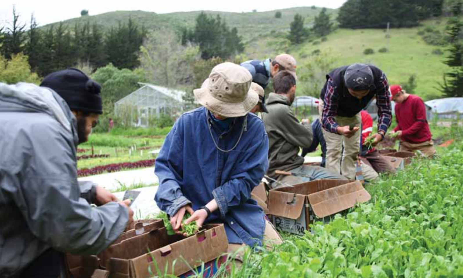
Harvesting lettuce at Green Gulch Farm, which supplies organic produce to local businesses, City Center, and the community's famous vegetarian restaurant, Greens.