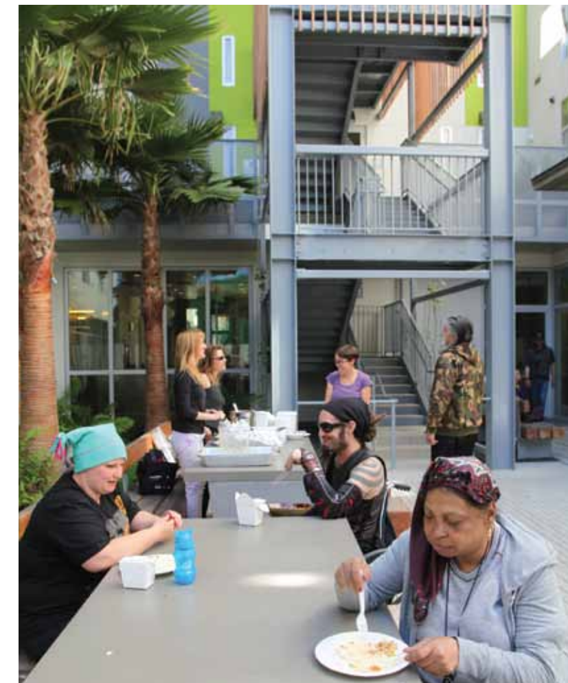
Formerly homeless residents at Richardson Apartments enjoy a healthy meal brought to them by Zen Center volunteers. "I like this kale!" says one resident in her fifties.