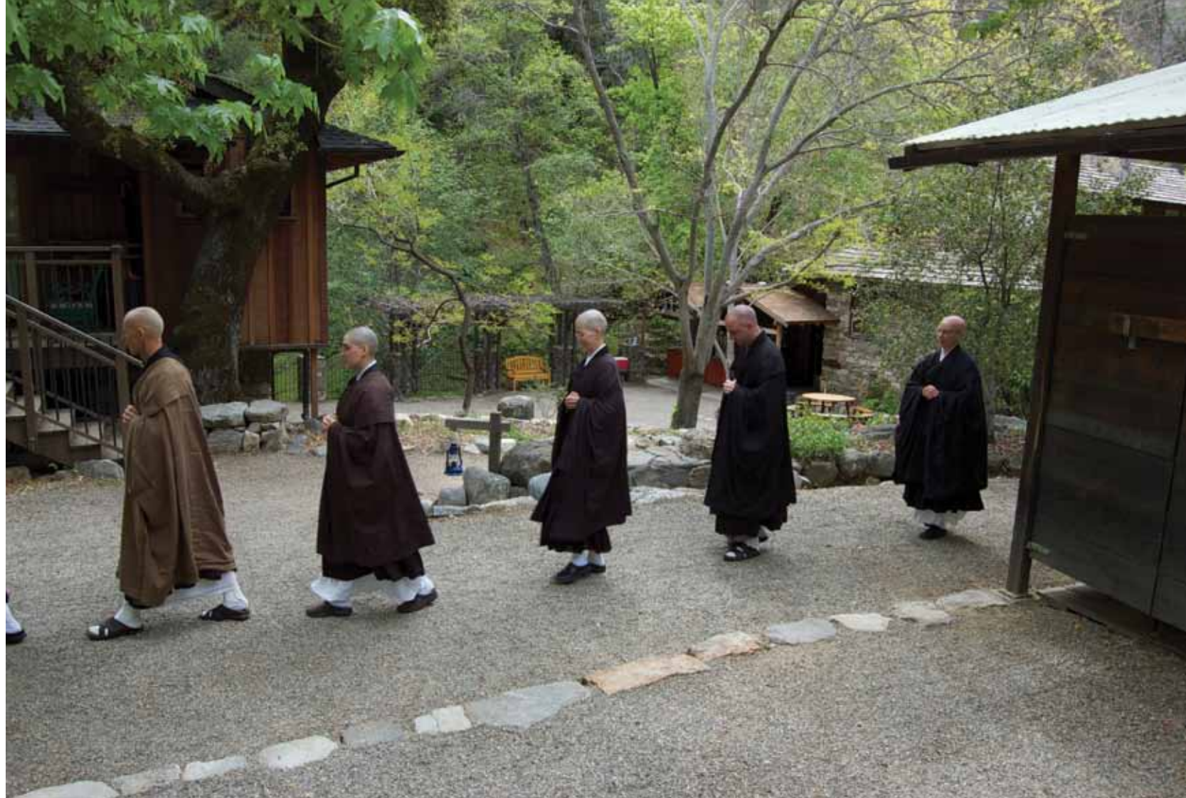
Above: Ceremonial procession at Tassajara, the first Zen monastery located outside of Asia.