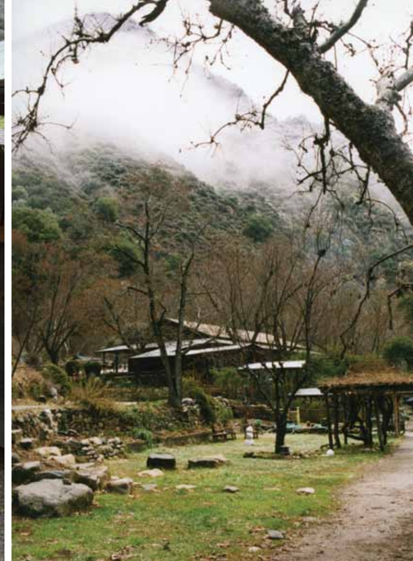
Right: Zendo at Tassajara in the winter.